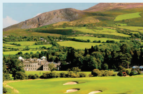
Country Wicklow "The Garden of Ireland"