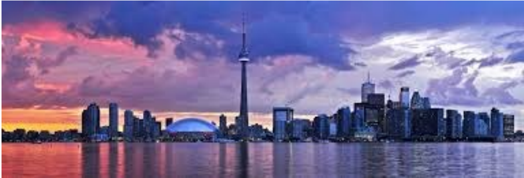
Toronto, Canada Skyline

Details will be coming in the near future!